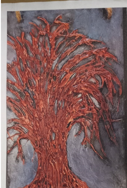
Relief taught by Noreen Walker April 1, 2023